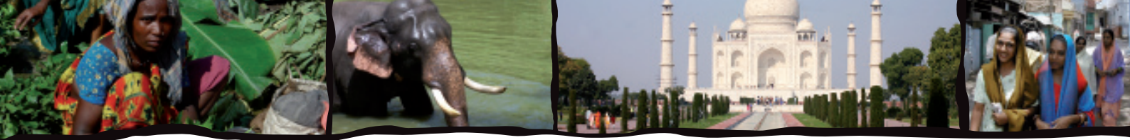
Table 1. Major Travel Health Issues & Considerations for India